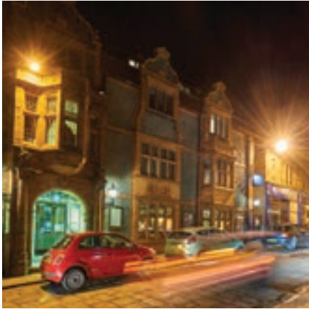
The Castle Hotel, Conwy.