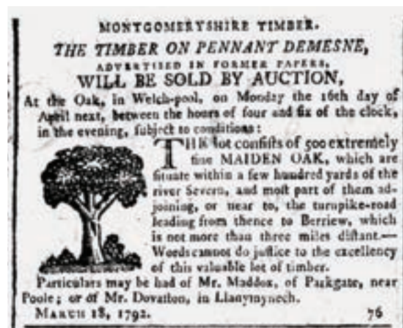
Chester Chronicle 23 March 1792.

In March 1796 The Royal Oak hosted another notably large timber auction, of 1,437 oak and 279 Ash and Elm trees located in woods in and around Vaynor Park, near Berriew. The sale notice advised potential buyers that the trees were within half a mile of the new canal, which was expected to be navigable to Berriew by October.