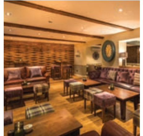
One of The Royal Oak's reception rooms.