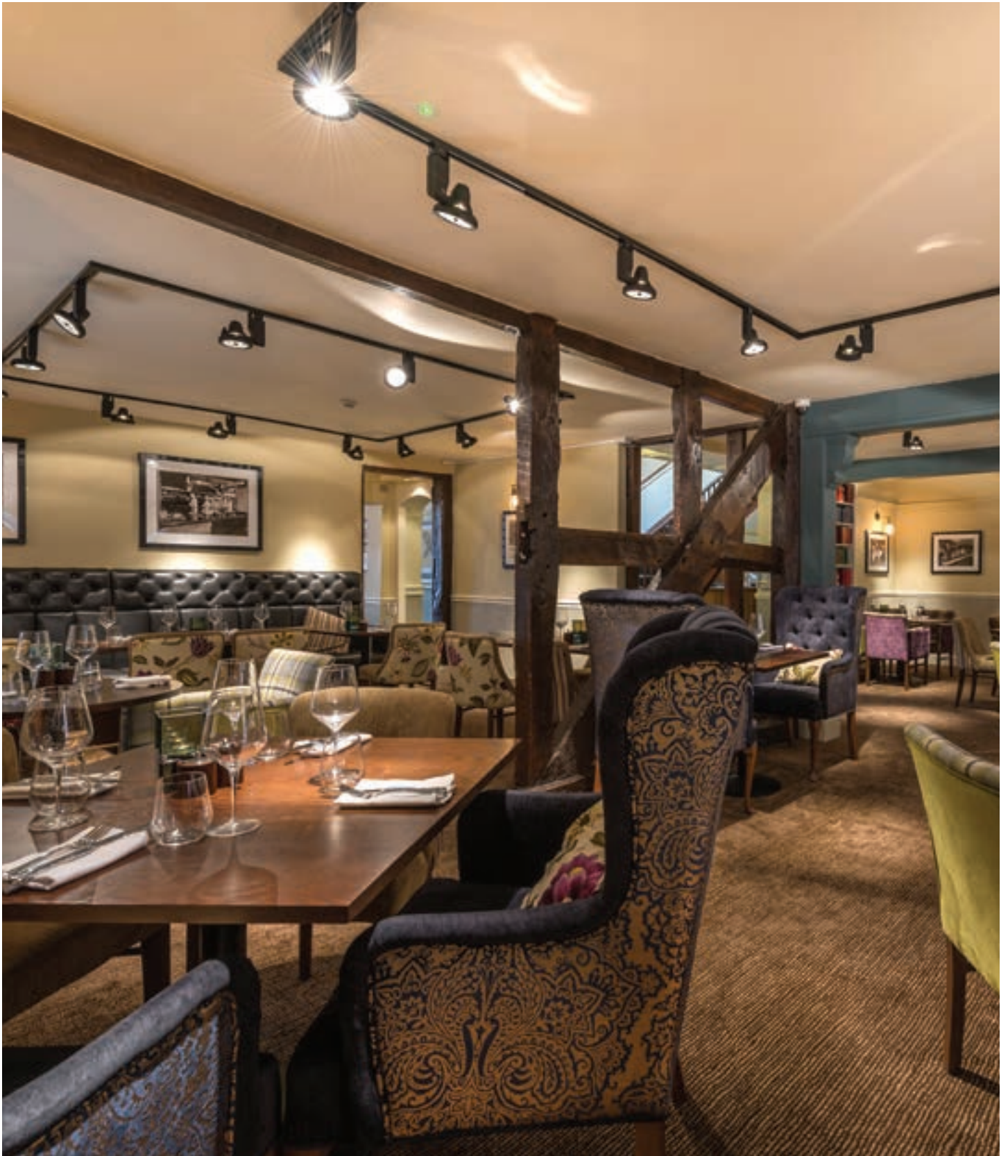
The exposed timber-frame partition in the dining room.