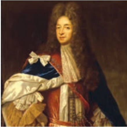
William Herbert 1st Duke of Powis (c.1626–1696), by Francois de Troy.