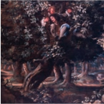
Charles Stuart asleep in the oak tree at Boscobel Wood, by Isaac Fuller, circa 1660s.

"...he [Charles Stuart] and a lone protector were forced to hide in the upper branches of an oak tree at Boscobel Wood..."