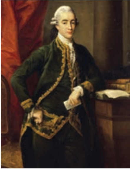
George Herbert 2nd Earl of Powis (1755–1801), by Pompeo Batoni 1776.

William Herbert, the 2nd Duke of Powis, died in 1745, followed in 1748 by his son, William, the 3rd duke, who was unmarried and left no heir.