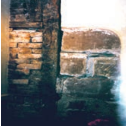
Medieval stonework exposed in the dining room. Photo courtesy Clwyd-Powys Archaeological Trust, ref. 4416-001.

"...the stone was within the timber framework of a Tudor structure..."