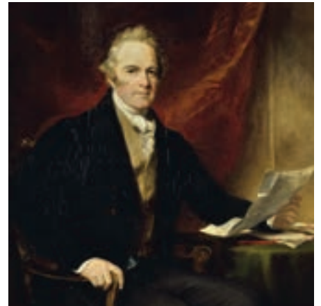
Edward (Clive) Herbert, Viscount Clive (1785–1848), by Francis Grant.