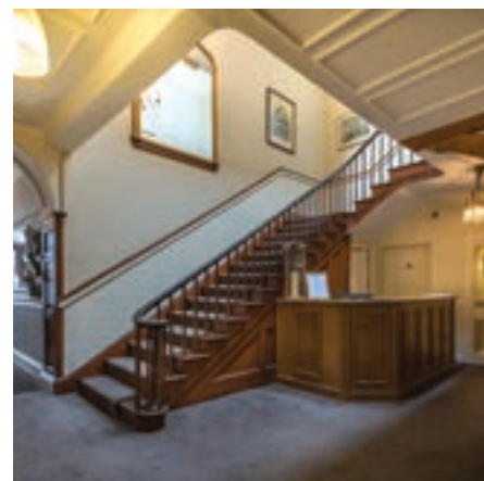
The central staircase.