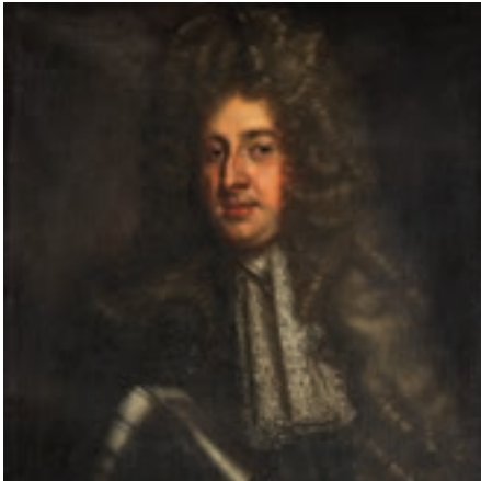
William Herbert 2nd Duke of Powis (c.1660–1745), attrib. Francois de Troy.

On Percy Herbert's death in 1667 the barony of Powis passed to his son William, who in 1674 was elevated by Charles II to the title Earl of Powis – perhaps another opportunity for the naming of The Royal Oak Inn.