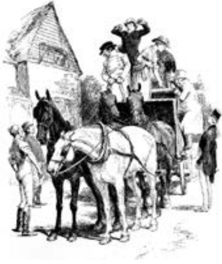
'Arriving at the inn', from a series of drawings by Herbert Railton and Hugh Thomson, c.1893.