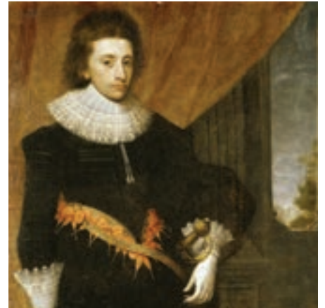
Percy Herbert, 2nd Baron Powis (1598–1667), who could have named The Royal Oak Inn. Possibly by Paul van Somer, early 17th century.