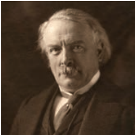
David Lloyd George (1863–1945), photographed in 1917 by Olive Edis.

Afterwards The Royal Oak was leased to the Church Stretton Hotel Company. Major alterations were completed in April 1901, just one month before the start of construction work on the Welshpool-to-Llanfair Light Railway. This should have been good for The Royal Oak, which hosted the formal dinner after the official opening of the line in 1903. But unfortunately the Church Stretton Hotel Company went bust in 1909.