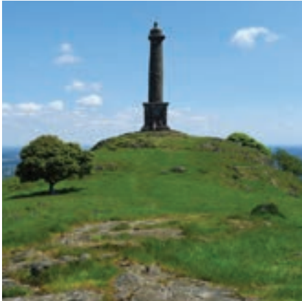
Rodney's Pillar on Breidden Hill.

"...local landowners were proud of their contribution to the Royal Navy's repeated successes in battle."