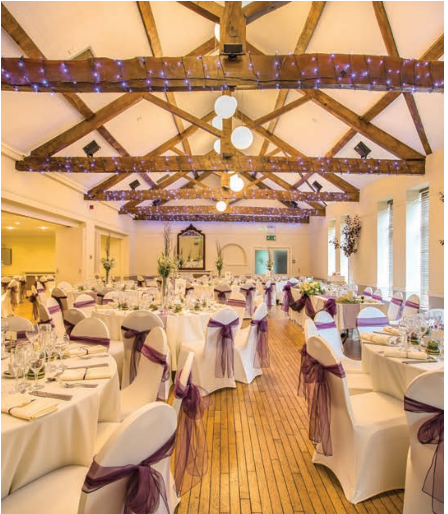
The Powis Suite, The Royal Oak's events space.