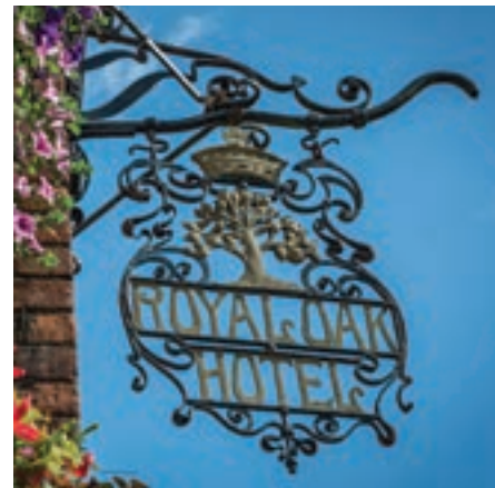
The wrought-iron hanging sign.

The date of the bill supports expert opinion on the period of the main building of The Royal Oak. Although it has since been subject to numerous alterations, some important detailed elements of Georgian styling of the mid-1700s remain today, including the fine central staircase and a superbly crafted wrought-iron hanging sign depicting the emblems of the oak tree and crown.